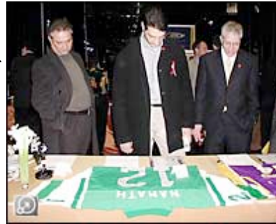
Gala attendees bid on a jersey worn by Joe Namath