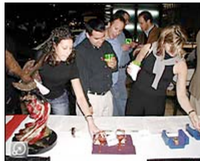
Jimmy Choo shoes worn by Sarah Jessica Parker in "Sex and the City"

Press conferences will begin on Wednesday with a host of planned introductions. Lincoln, Mitsubishi, Nissan and Saturn are just a few of the automakers that will make new-product announcements. Check out cars.com regularly on Wednesday and Thursday for breaking coverage.