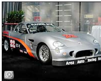
Panoz Esperante GTS racer

The Magnussen Edition Esperante is the first of two driver's edition vehicles to enter production this year. A David Brabham Edition vehicle will be introduced in a few months, according to Panoz. A total of 20 Driver's Edition Esperantes will be built each year to commemorate the team's leading drivers Jan Magnussen and David Brabham. The 10 Magnussen Edition and 10 Brabham Edition Esperantes celebrate the 10 American Le Mans (ALMS) races held annually.