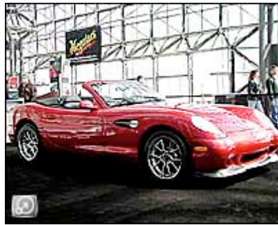
2002 Panoz Esperante Magnussen Edition

NEW YORK — One of the best-kept secrets at the New York Auto Show is the presence of the Panoz Auto Development Company. The independent, low-volume automaker, which is based in Hoschton, Ga., is at the Jacob K. Javits Center to introduce a limited edition — make that a micro-edition — of its luxury sport convertible. The Panoz Esperante exhibits the type of swoopy, low curves that made classic Jaguars the favored cars among the English nobility.