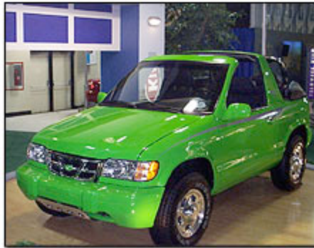
Kia Sportage 4x4